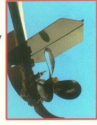
专利号 Patent number